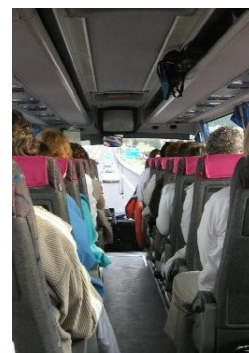
Vigilante Bus Tour

Another unique donation is a policeman's "billy-club", circa 1880-1900, that originally hung in the Lucan jail. The club, made from an old hollowed-out chair leg filled with lead, must have made a formidable weapon!