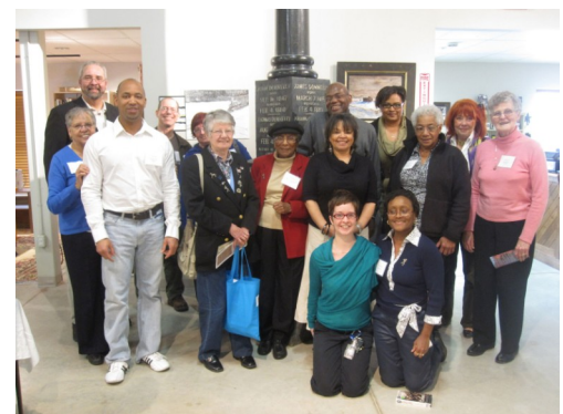
Representatives attending the Black History Roundtable gather around the replica Donnelly tombstone for a group picture.